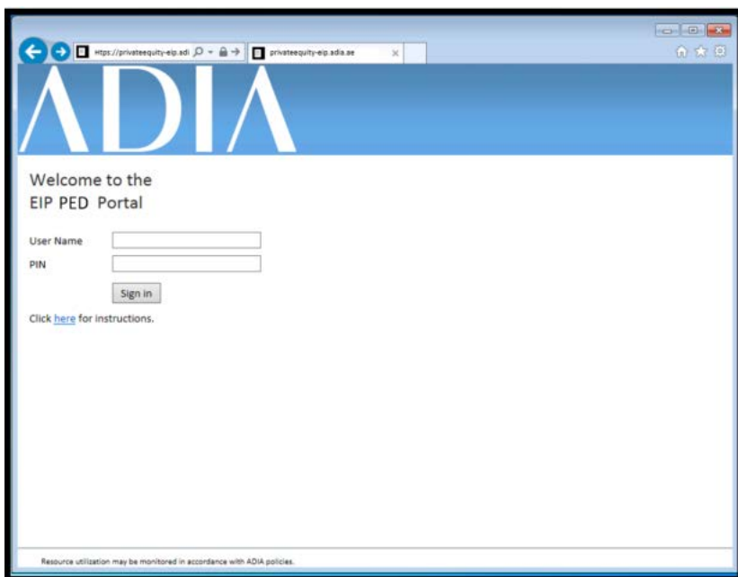
Figure 1: EIP Login Page