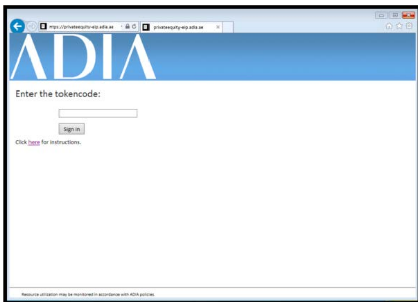
Figure 4a: Secure Access login screen where tokencode needs to be entered

You will be asked to enter the tokencode as shown in the screenshot below. The tokencode will be emailed to your registered email address. Upon receipt of the email enter the tokencode into the appropriate field.