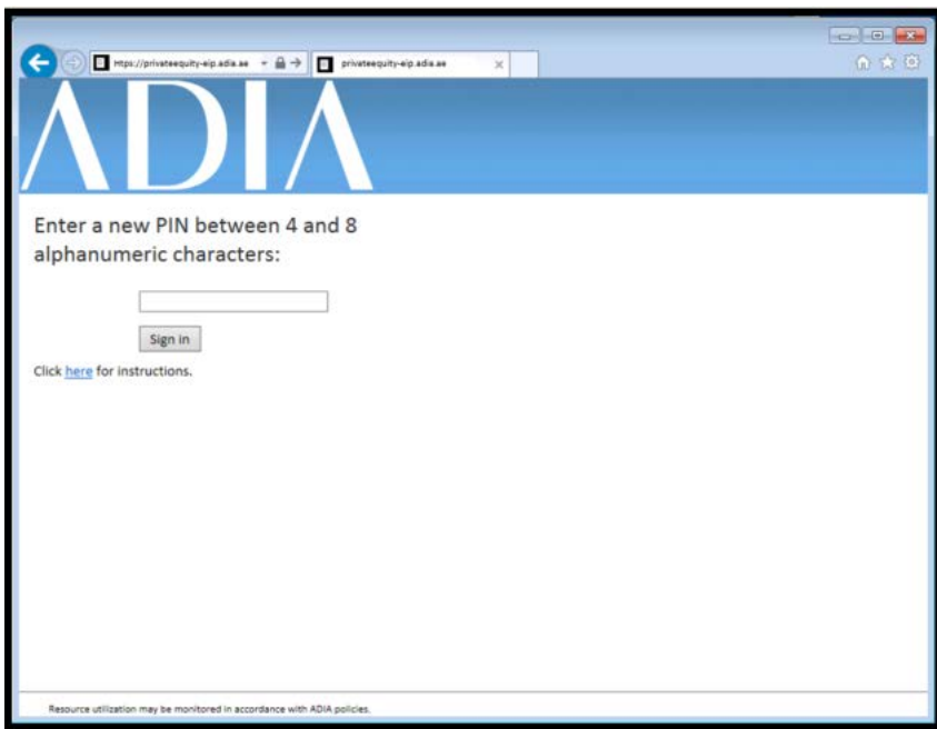
Figure 2.2: Prompt to enter new PIN on the Secure Access screen on first login.