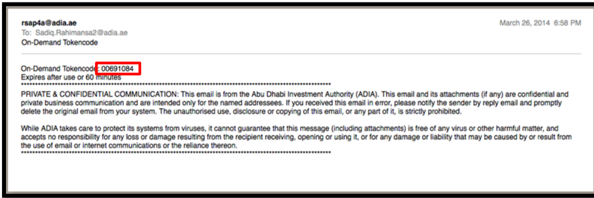
Figure 4b: Tokencode received by email which needs to be entered into the Secure Access login screen

If you forget your PIN or have any other issues logging on to the EIP portal please contact ADIA IT HelpDesk at EIPPESupport@adia.ae